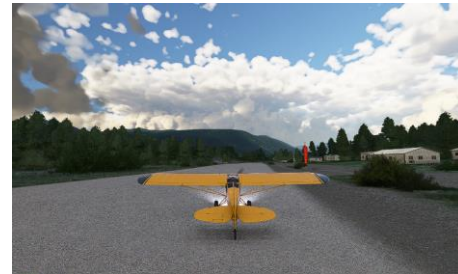
Departing Silver City