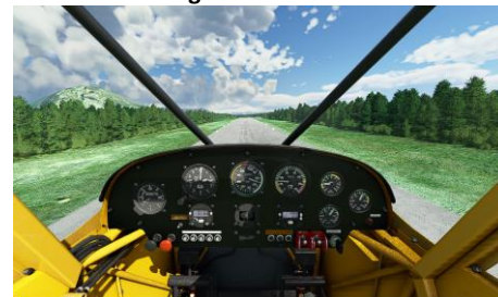
Haines Junction (CYHT)