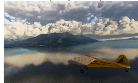
Heading to Haines Junction